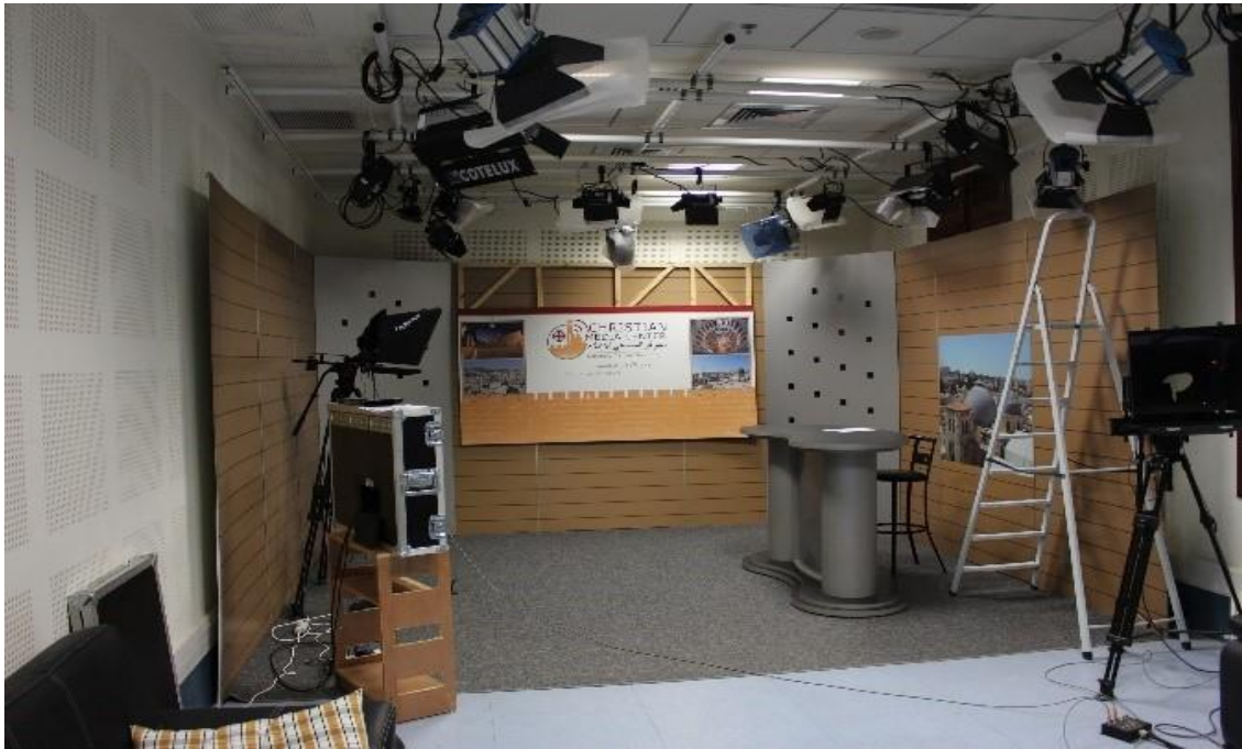
Figure 3. Simulating Western journalist studios: Media Center in Jerusalem, 2017.

It should be noted that this practice is not exclusive to the Franciscan/Canção Nova operation, and can be observed among other denominations and faiths. For example, the main Pentecostal movement in South Korea operates a similar studio for broadcasting sermons from the grand Yoido Full Gospel Church in Seoul (see Figure 4).