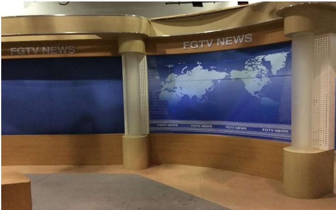
Figure 4. Using the broadcast aesthetic: Religious Christian broadcast studio at the Yoido Full Gospel Church in Seoul, 2016.

The journalistic style includes engagement with controversy and issues of public concern. In these videos, we identified extensive reference to conflict-based issues that relate to Christian communities.