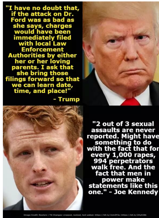
Figure 6. An example of collected #MeToo memes from Twitter that uses logos as a persuasive appeal.

The persuasion technique variable measured here was based on the meme's dominant mode of persuasion. Although the ethos technique was prominently used in #MeToo Twitter memes overall, this technique dominated only 8.4% of the memes in our sample. Furthermore, our analysis suggests that the ethical appeal was used less prominently in antimovement memes (2.5%) than promovement memes (5.9%). Together, these results suggest that anti-MeToo memes focused most on the emotional appeal (see Figure 7) and less on the logos and ethos appeals than pro-MeToo memes.