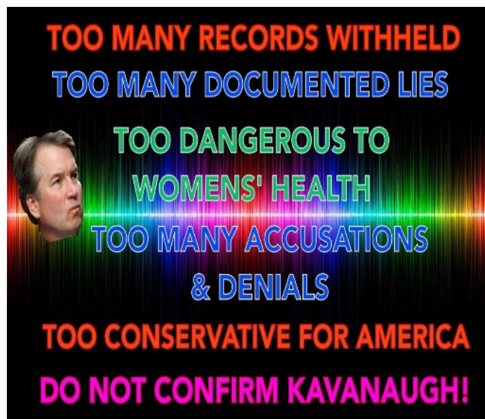
Figure 1. An example of collected #MeToo memes from Twitter that is text-dominant.

Each meme was coded as picture-dominant, text-dominant, or equally dominant. To be coded as visually dominant, a meme's message needed to be communicated primarily through the visual. To be coded as text-dominant, the meme needed to be heavily dependent on text (see Figure 1). Memes that depended on both the picture and the overlaid text equally were coded as equally dominant.