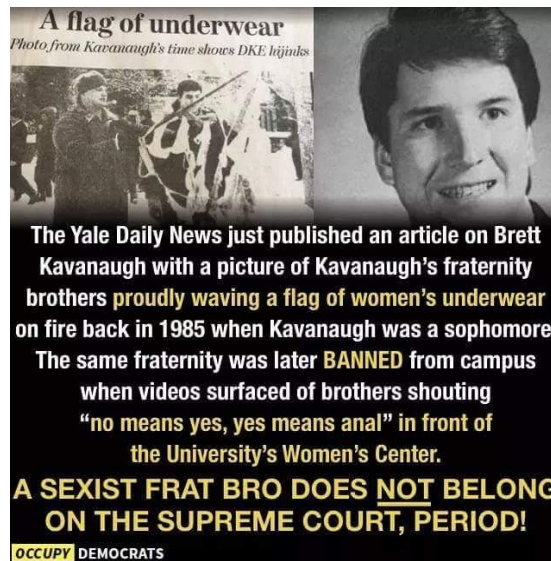
Figure 5. An example of collected #MeToo memes from Twitter that uses logos.