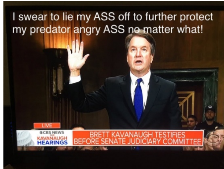
Figure 2. A collected #MeToo meme from Twitter that uses contrasting visuals and textual information.

This variable was coded based on whether the overlaid text matched the picture in the meme. Each meme was coded as complementary or contrasting. Figure 2 shows an example of contrasting visual and textual information. Memes that did not fit into these two categories were coded as not applicable.