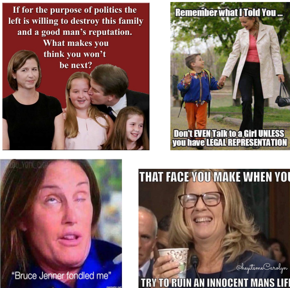
Figure 8. Examples of the most retweeted anti-MeToo Twitter memes using the pathos appeal.

Moreover, individuals not likely to be engaged in politics may have developed through #MeToo memes a vested interest in the process (see Heiskanen, 2017). Memes have the capacity to influence people's political perspectives as a persuasion tool (Kadir & Lokman, 2014), especially social media posts focusing on emotions (Nave et al., 2018). Therefore, it is not surprising that more than eight in 10 memes in our study used the pathos appeal. Digitized narratives of sexual violence on Twitter forge new mediated connections and create "new affective platform vernaculars" (Mendes, Keller, & Ringrose, 2019, p. 1293). A wide array of feelings was represented, ranging from sympathy (directed at or against Kavanaugh) to humor (see Figure 8). Users sometimes personalized the issue by drawing from their own experiences or emotions, playing on emotions like anger or sympathy.