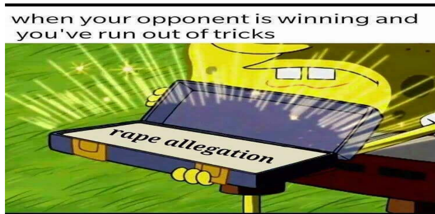
Figure 7. An example of collected #MeToo memes from Twitter uses pathos as a persuasive technique.