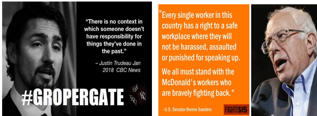
Figure 9. Examples of the most retweeted pro-MeToo Twitter memes using logos and ethos appeals.

The main contribution of our study does not lie so much in identifying the persuasion appeals used, but in revealing a deeper issue pointing to differences in the techniques that framed the tone of the MeToo movement on Twitter. A large portion of our study focused on unpacking the various modes of persuasion used in the #MeToo meme culture. Guided by previous literature, we argue that the dominant mode of persuasion used allowed for additional insights into how the MeToo movement was framed in viral memes and, in doing so, become tools to promote awareness about this movement.