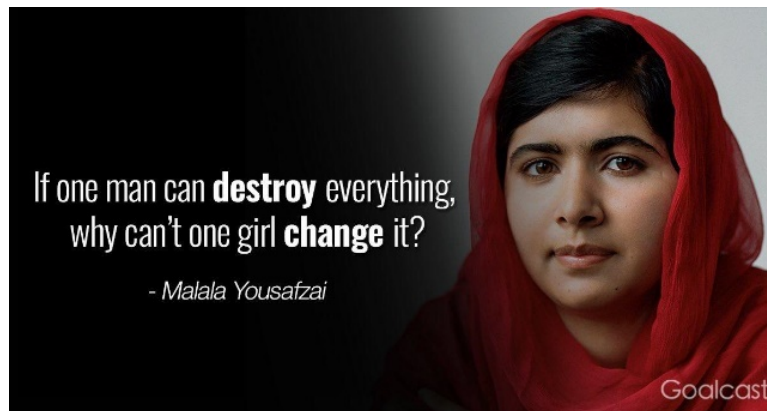
Figure 3. A collected #MeToo meme from Twitter that pictures Nobel Peace Laureate Malala Yousafzai.