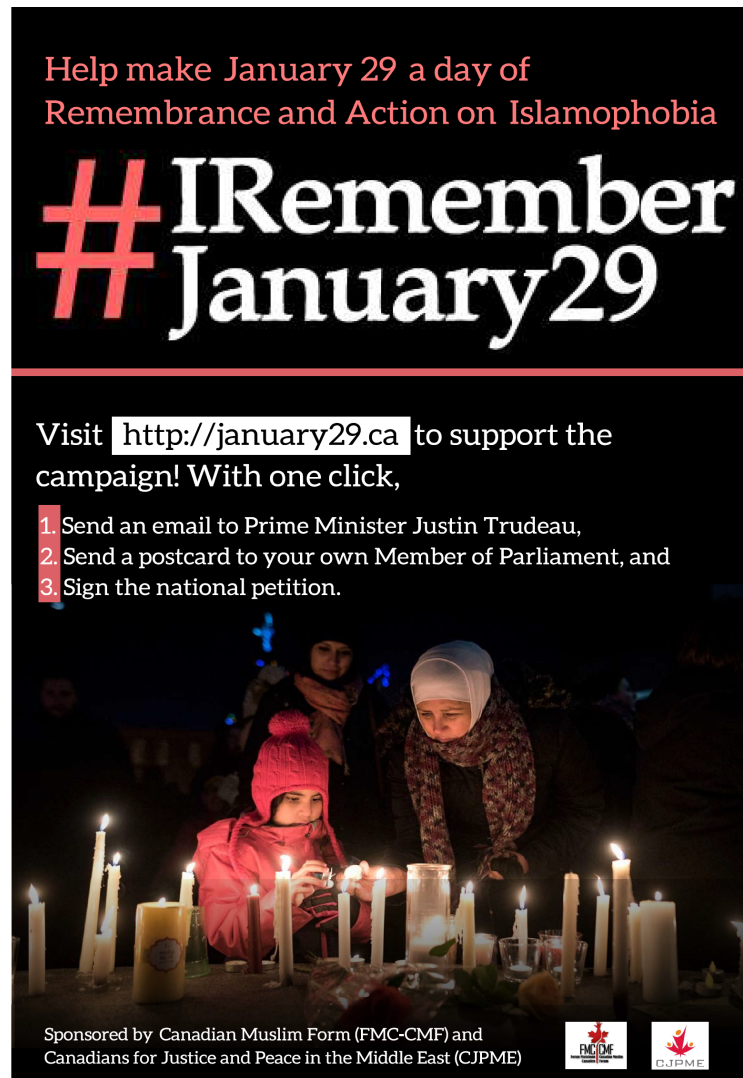
Figure 5. Poster of the campaign (CJPME, 2018b).