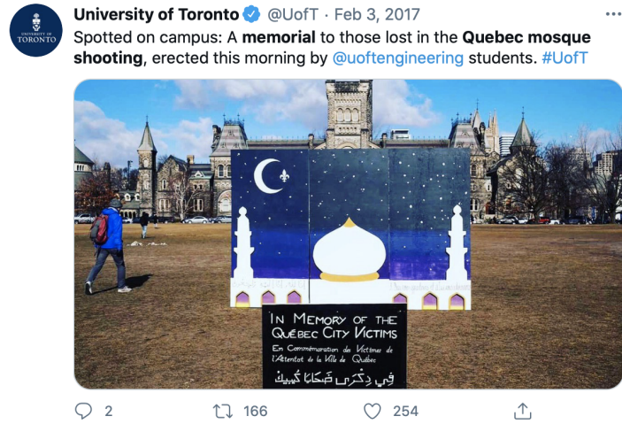
Figure 1. Tweets showing the spontaneous shrines emerging in the immediate aftermath of the Québec mosque shooting. For ethical reasons, we do not share individuals' usernames (Anonymous, 2017; University of Toronto, 2017).

2:07 PM · Jan 31, 2017 · Twitter Web Client