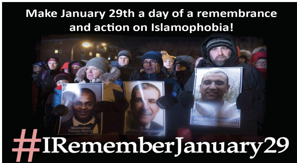
Figure 6. Small postcard (CJMPE, 2018a).

To bring public and media attention back to the report, CJMPE first conducted an online survey on Islamophobia. Hiring a professional polling company, CJMPE released the results of the survey at the same time as the report concerning systemic discrimination was released by the government of Canada. Still, there was scant attention given to both of these events in the Canadian media or from politicians. As Woodley recounts: