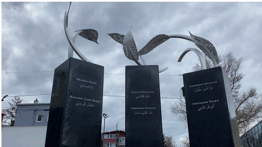
Figure 2. Québec City memorial commemorating the victims of the mosque shooting (Campbell, 2020).

It took more than four years for the Québec government to construct a memorial to the victims of the mosque shooting. Only in 2021 did the Canadian government formally recognize January 29 as a day of commemoration for the victims of the Québec mosque shooting. Unveiled on December 1, 2020, the memorial constructed by the Québec government is titled Vivre Ensemble (Live Together) (see Figures 2 & 3). Designed by artist Luce Pelletier, it is located close to the mosque. It offers an account of the event as well as the names of the victims (Plante, 2021).