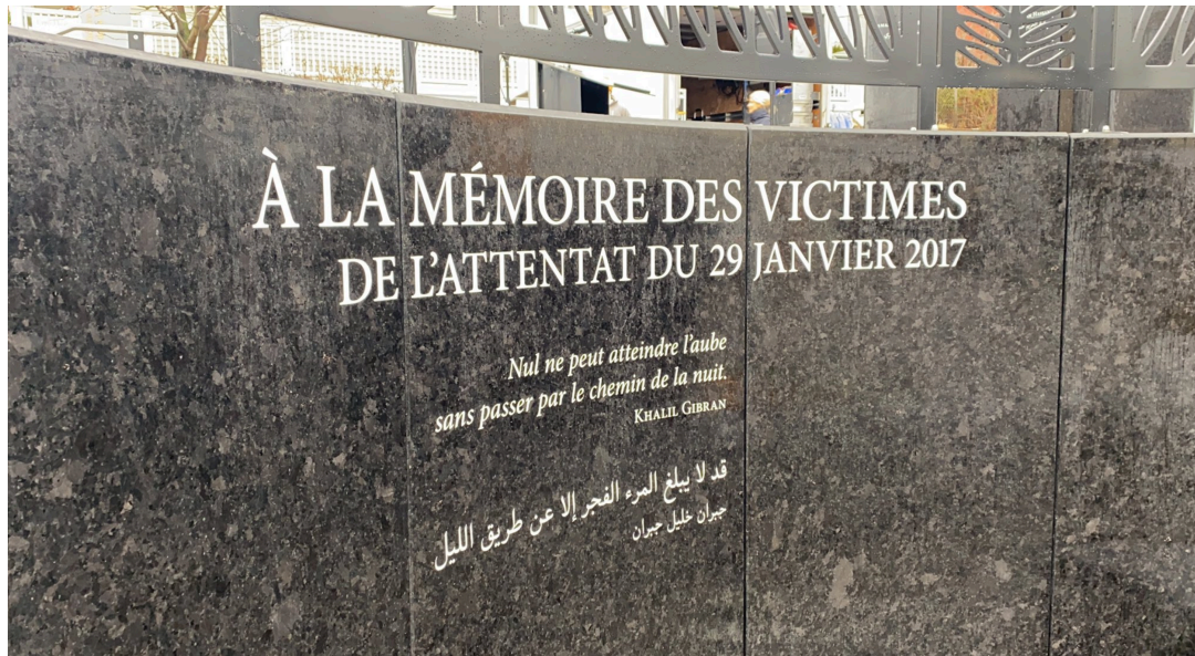
Figure 3. Memorial for the victims of the Québec mosque shooting (Hassin, 2020).

Interestingly, the memorial does not shy away from including the Arabic script, which is a quote from Khalil Gibran, “Nul ne peut atteindre l’aube sans passer par le chemin de la nuit” [One may not reach the dawn save by the path of the night] (Gibran, 1926). The metal filigree at the top shaped like leaves incorporates designs indigenous to the respective countries of the victims. A syncretistic blend of East and West, the memorial exemplifies the cultures, origins, and new homeland of the victims. It gestures to the sympathy and empathy of the designer most explicitly, and perhaps implicitly, to the government that financed it. Yet the sheer length of time it took, not to mention the advocacy by community groups, to have the event recognized and memorialized as an attack, is indicative of how the power of vernacular memorials can shift the political ground in making and marking an event as significant in the national imagery. Nonetheless, the Québec government, to this day, refuses to acknowledge systemic racism or Islamophobia. What, then, led to this shift in public consciousness and how did the vernacular memorials of the community, both online and offline, influence this move by the state to formally declare January 29 as a day of commemoration? In the section below, we address two digital memorial campaigns that, in our opinion, contributed to the pressure on the state to formally recognize the event and to mark it as a day of commemoration.