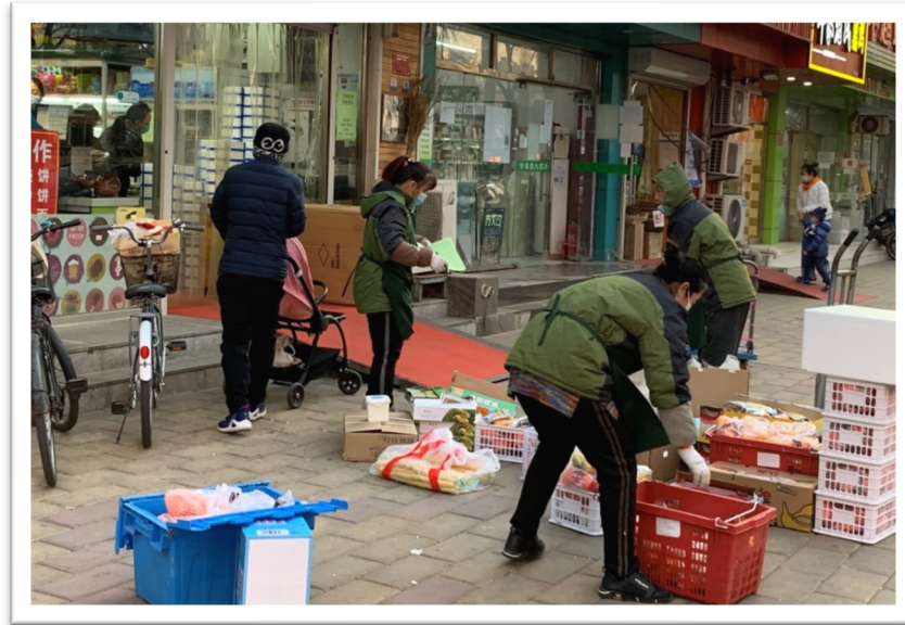
Figure 2. Staff in community group buying checking the food.