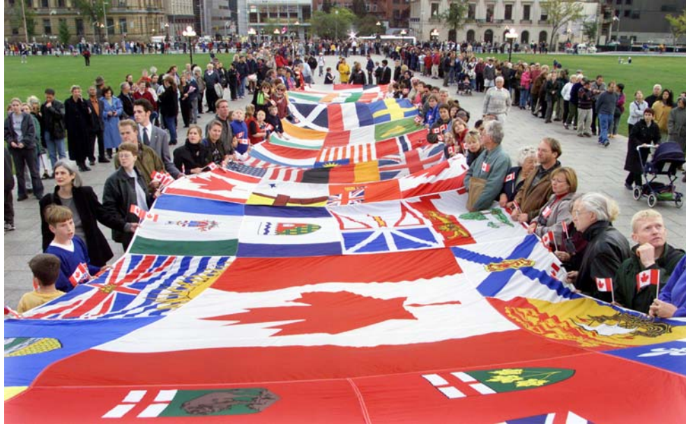
Figure 6. Giant banner with flags on Parliament Hill in Ottawa, Sept. 30, 2000.

Consistent with the attention to Potter, the diversity of the crowds lining the streets or queuing to view the casket were heavily remarked upon in text and image, in terms of the regions they represented, their ages, and their race and ethnicity. About the crowds in Ottawa, the Canadian Press commented: