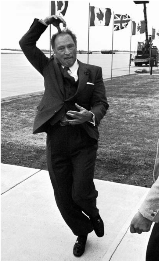
Figure 2. Pierre Trudeau reprises his famous pirouette, first performed in the company of Queen Elizabeth II, after the proclamation of the Constitution Act in Ottawa, on April 18, 1982.