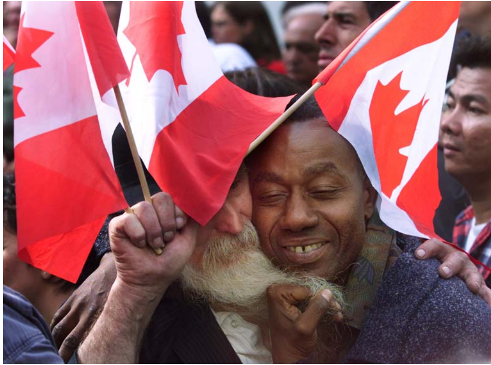
Figure 7. Two Men Embrace after the State Funeral of Pierre Trudeau in Montreal, Oct. 3, 2000.

Of course, it's hard to judge how selective the press were to achieve these images and reports that emphasized unity. Certainly comments like Mandel's suggest that some reporters brought a fair share of sentiment and romance to their work, perhaps more commonly in the tabloid-style papers. The themes of unity and nationalism were prominent in the coverage, particularly in the English-language sources, and evidently there were images and quotes widely available to tell these stories. For those concerned about the ideological nature of "memorial broadcasting," its characteristics are there to be found in the Trudeau coverage, but the extent to which reporters imposed this frame on their stories is difficult to determine. It wasn't the same immigrants, for example, quoted across different news stories, but many different Canadians who had come from other countries and told very similar stories about the importance of Trudeau in that process. Presumably, if no sentiment or attention to emotion appeared in news coverage, it would no longer be an accurate representation of public participation in the events. Without detailed ethnographic reports on all who attended, such as those procured by Lang and Lang (1953) in their study of General MacArthur's return to the U.S., it's difficult to evaluate how the patterns that appeared in the press representations deviated from the "reality" on the ground.