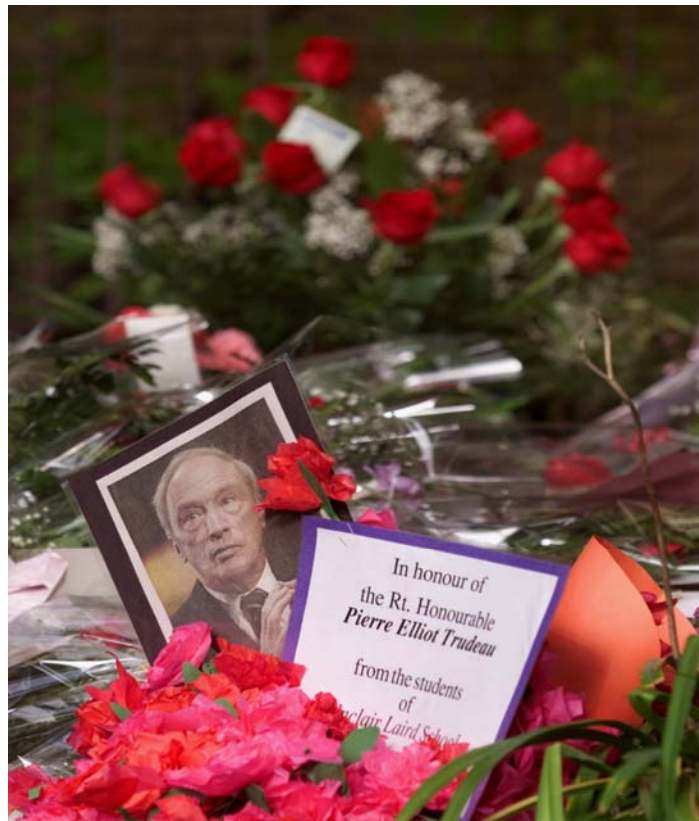
Figure 4. Flowers and cards left outside the home of Pierre Trudeau in Montreal, Sept. 29, 2000.

The cameras captured the responses of the public, both in "person-on-the-street" interviews and by recording the different gestures that people undertook to mark Trudeau's passing. While Princess Diana's funeral saw mass vigils outside Buckingham Palace and her home with teddy bears, flowers, and notes, Trudeau's funeral saw the public congregating outside his home in Montreal and on Parliament Hill in Ottawa, some clutching notes, and many bringing roses, in remembrance of the fresh rose that Trudeau wore in his lapel every day of his tenure as prime minister.