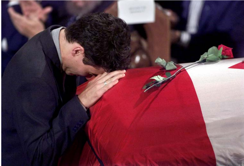
Figure 8. Justin Trudeau rests his head on his father's casket at the state funeral, Oct. 3, 2000.

& Lucaites (2007) have suggested about iconic images in general, the photo connected the abstraction of citizenship to a concrete moment and gesture.