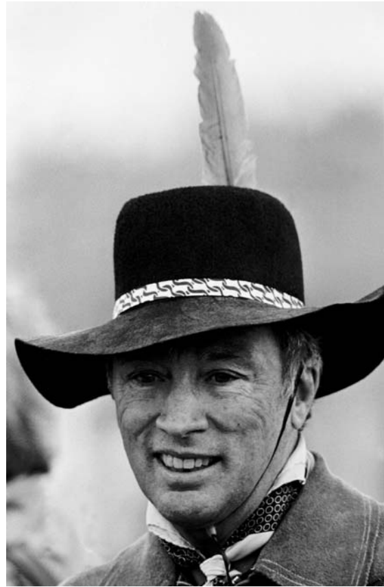
Figure 3. Pierre Trudeau at the opening of an archaeological excavation in Hull, PQ, on May 20, 1983.

The word "charisma" and Pierre Elliot Trudeau have long been linked. Press coverage upon his death returned to this theme again and again as in this comment: "He has been called an enigma, a bewitcher, even a 'magus.'" 2 Like John F. Kennedy, Trudeau came of age politically in the 1960s just as the medium of television became so important to politics, and his personality seemed to make him a media star. One gets a sense of his media profile from a comment in Le Soleil which said, "Was there ever a world leader who was photographed as often in his bathing suit? And who, in doing it, and despite