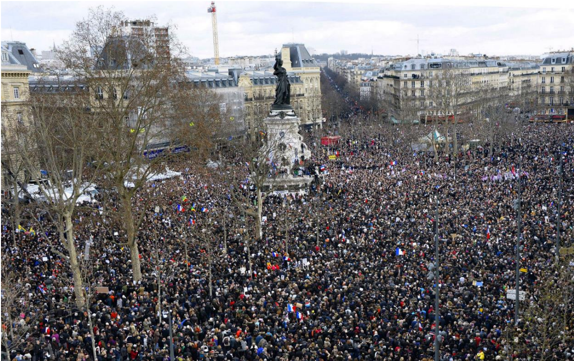
Figure 2. The Paris "rally of national unity."