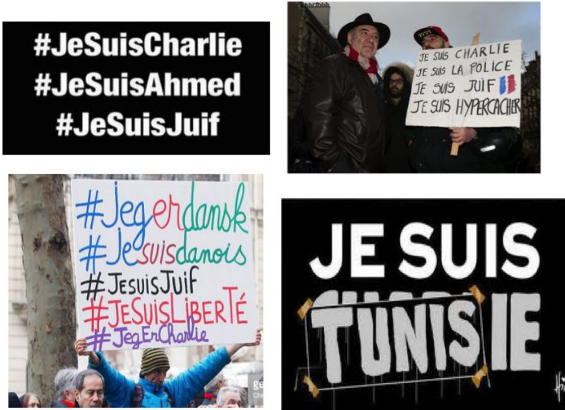
Figure 7. A new “je suis” meme after the attack on the Bardo Museum in Tunis.

On March 18, a violent attack on the steps of the Bardo Museum in Tunis killed 22 people outright, with another person dying later. One could debate whether this was actually a part of, and should be included in, the Hebdo event chain. Its inclusion might require that many other acts of jihadist-inspired violence be attached to Hebdo, an issue that should certainly concern future historians. I, acting as a contemporary historian, include it here because the collective response triggered new hashtags—“JeSuisTunisie” and “JeSuisBardo”—connecting it in representation and memorialization to Hebdo.