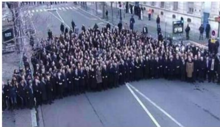
Figure 3. World leaders attend a Paris rally—but do not lead the march.