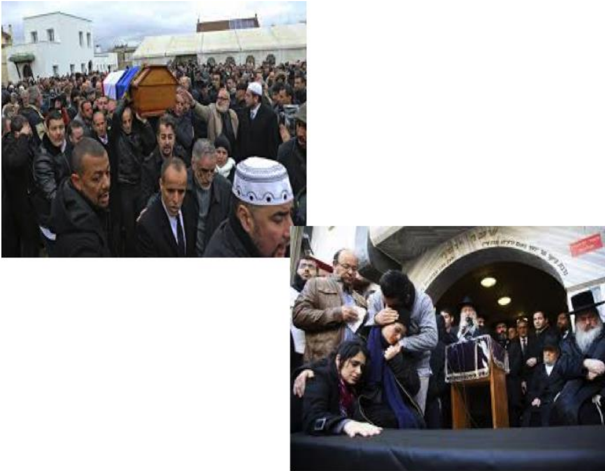
Figure 5. Muslim and Jewish funerals in Paris.

One of the problems of media studies is that it can tend to inflate the internationalization of media content while overlooking the multiculturalism of populations. Paris showed the different communities caught up in Hebdo, with formal funerary protocols for police officers as well as Muslim and Jewish ceremonies.