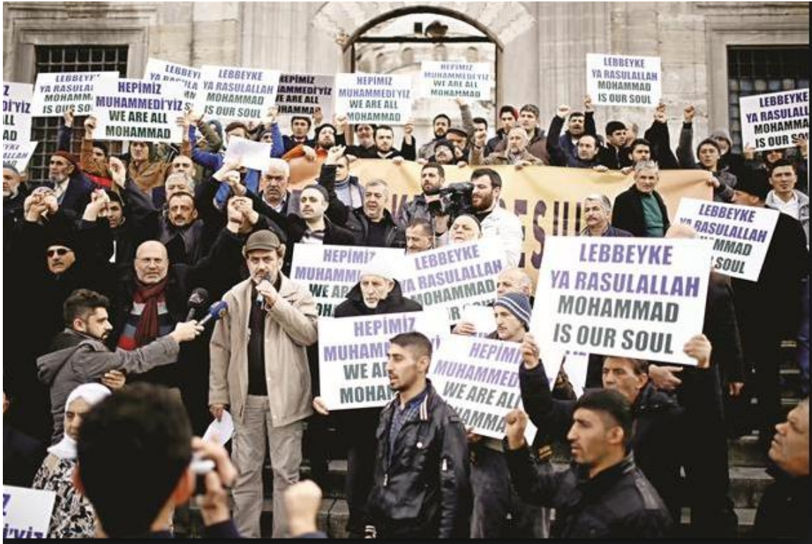
Figure 4. A counterdemonstration in Turkey.

But there were plenty of contrary and negative responses. Rallies in Turkey and Indonesia, which enjoys the largest Muslim population in the world, changed the identification to “We are all Mohammad.”