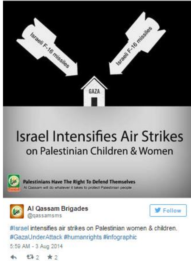
Figure 4. Al-Qassam victim ( http://t.co/T1CoLyXMmA [tweet]).