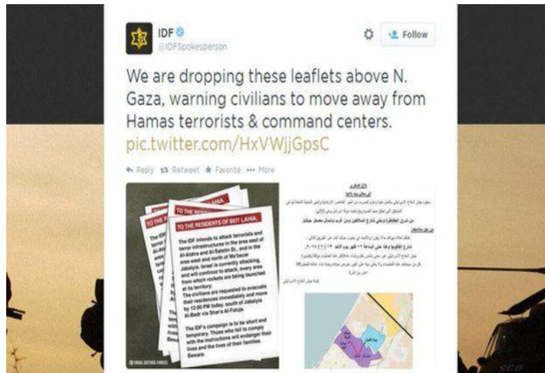
Figure 3. Israeli Defense Forces identity expression ( http://t.co/HxVWjjGpsC [tweet]).

These examples illustrate the first unexpected narrative outcome of how an actor's lack of awareness of its characteristic self-expression can have the unintended effect of creating misunderstandings and negative misperceptions.