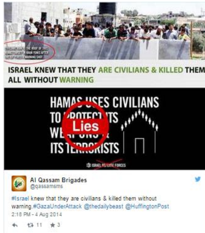
Figure 9. Al-Qassam appropriated tweet ( http://t.co/Xe19Uni742 ).

On the military battlefield, sustained physical attacks by one side often lead to the physical elimination of the other side. On the narrative battlefield, attacks often serve as triggers for identity resilience that prompt the actor to become more assertive in identity self-expression and self-preservation. The result of the dueling identity resilience can produce another narrative paradox: Rather than one side defeating the other, repeated attacks and counterattacks can cause the two sides to become more entrenched, with the mirror images producing a polarizing effect. Identity resilience helps sustain the polarizing effect of the cycle of counternarratives. The polarization on the Twitter battlefield was captured by Gilad Lotan (2014) in Figure 10. The “pro-Israeli” camp in blue is on the left, and the “pro-Palestinian” camp in green is on the right.