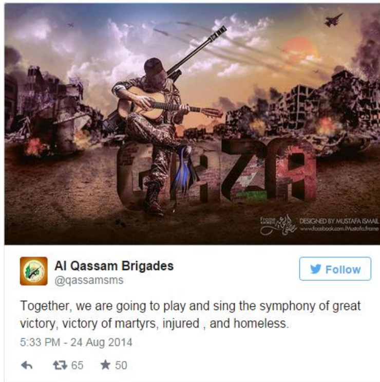
Figure 12. Al-Qassam victory ( http://t.co/Ig9z3Ri6wS ).

The Israeli side also claimed victory. Israeli Prime Minister Benjamin Netanyahu told a press conference that Israel had secured a "great military and political" achievement in the Gaza war and that Hamas had been dealt a "heavy blow" (Ravid, 2014, para. 1). On the diplomatic front, the prime minister said that Hamas had been isolated internationally, while Israel had "received international legitimization from the global community" (Israel Ministry of Foreign Affairs, 2014). The IDF tweet (see Figure 13) captures the Israeli victory narrative as relayed through a strong image and compelling statistics.