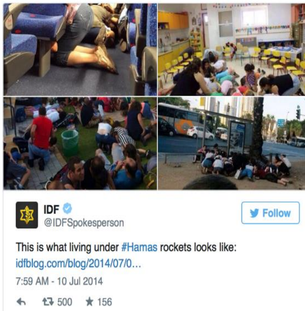
Figure 7. Israeli Defense Forces emotional mirror ( http://t.co/EdVt9IfzJk [tweet]).