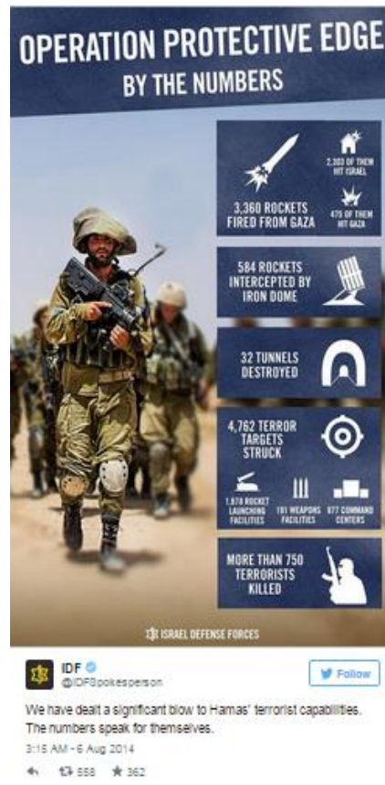
Figure 13. Israeli Defense Forces victory ( http://t.co/hgWGgVRRko ).

Thus, a final narrative paradox of identity resilience is that, unlike the decisive victory on the military or political battlefield, everyone can claim victory on the narrative battlefield.