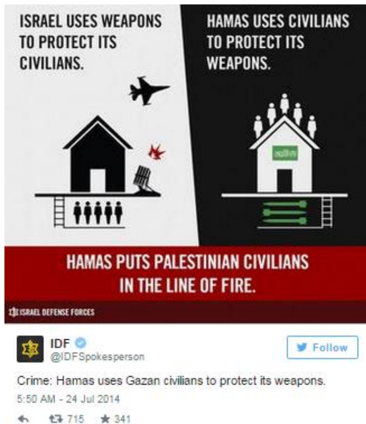
Figure 8. Israeli Defense Forces original tweet ( http://t.co/by2QzFI09d ).

During the Israeli– Hamas confrontation, both sides relied heavily on counternarrative strategies. Next to tweets telling their story, most of the tweets focused on refuting the legitimacy of the other’s story. The escalation of counternarratives produced an interesting co-creational dynamic between the two sides. Because the IDF appeared to be more sophisticated and prolific in developing graphics, al-Qassam started appropriating IDF graphics. Figures 8 and 9 depict an original IDF tweet that al-Qassam reappropriated in its counterattack.