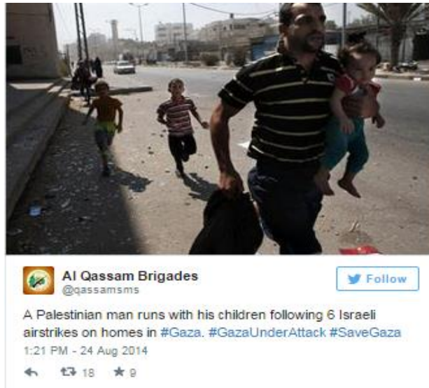
Figure 6. Al-Qassam emotional mirror ( http://t.co/z5f76OIPs6 [tweet]).