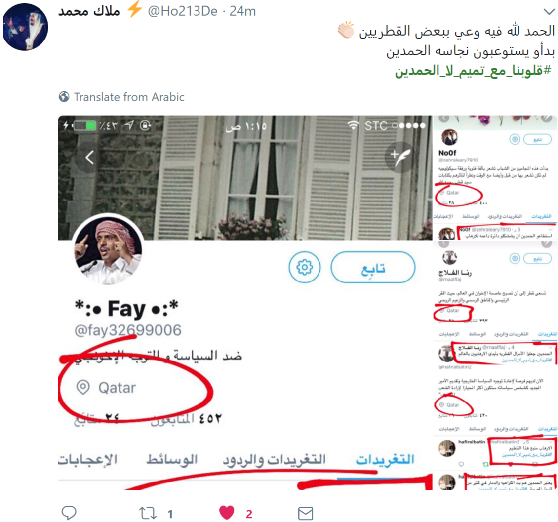
Figure 8. Tweet from an account seeking to highlight Qatar’s opposition to the two Hamads by circling the locations of Twitter users (bots).