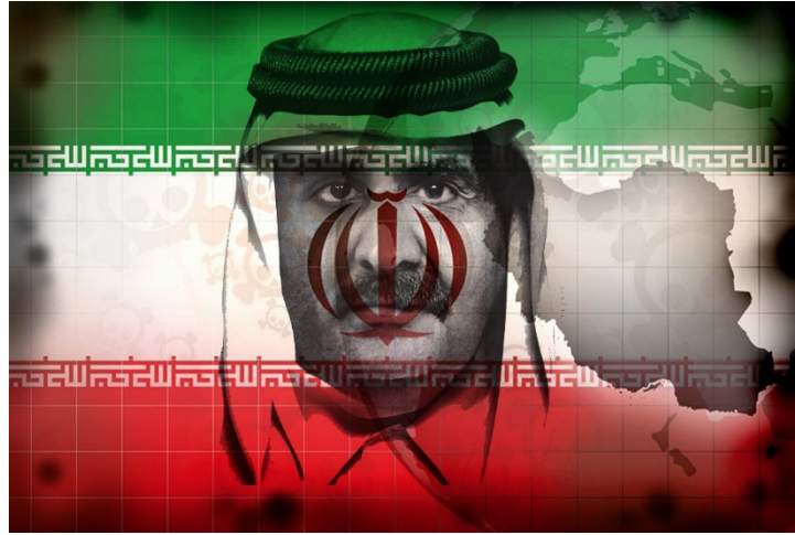
Figure 3. Infographic showing Tamim's head superimposed on the Iranian flag.

All the infographics had a similar aesthetic quality, containing a limited color palette and lists of various derogatory entries about Qatar. Figure 4 is a typical example of this. It is titled "Qatar Media Snake" and lists numerous journalists and public figures based in Qatar, including Wadah Khanfar, Azmi Bishara, and David Hearst. It is interesting to note that while none of these figures has been singled out in the 13 demands made by the Quartet, all of them work for or have contributed to the outlets singled out in the demands.