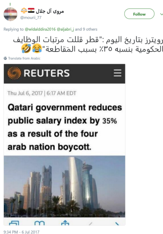
Figure 5. Tweet containing a screenshot of a fake Reuters article.

The account shared a superficially legitimate screenshot of a Reuters article with the title “Qatari Government Reduces Public Salary Index by 35% as a Result of the Four Arab Nation Boycott.” Although at first glance the screenshot looks like a genuine Reuters article, the story did not exist on the Reuters website. Closer inspection shows poor capitalization in the headline. This could be classed as an imposter (the impersonating of genuine sources) and a form of manipulated content (Wardle 2017). The purpose of the trend is unclear, although it could be an attempt to lower morale in Qatar and exaggerate the impact that the blockade was having, especially at a time when Gulf countries are conscious of implementing economic cutbacks. The fact that the hashtag was picked up by BBC Trending points to the utility of bots in projecting fake news content beyond the bounds of Twitter.