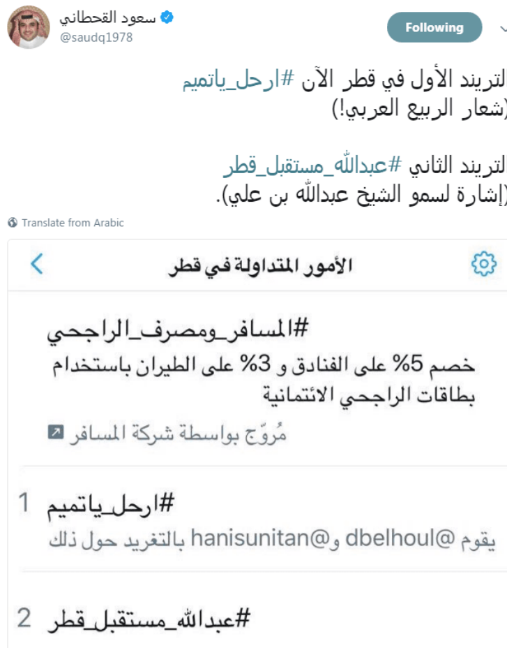
Figure 9. Tweet by Saud al-Qahtani showing a screenshot of top trends in Qatar.

Saud al-Qahtani was an advisor to the royal court and general supervisor of the Center for Studies and Information Affairs (at the time of writing). 7 He used similarly manipulated trends in Qatar to indirectly threaten the Qatari authorities and engage in coup-bating (the use of propaganda to encourage regime change). On August 21, 2017, al-Qahtani (2017b) tweeted "The top trend in Qatar now is #LeaveTamim." 8 With this tweet, al-Qahtani included a screenshot of Twitter's trending topics, as if to alleviate any doubt about the veracity of his statement (see Figure 9).