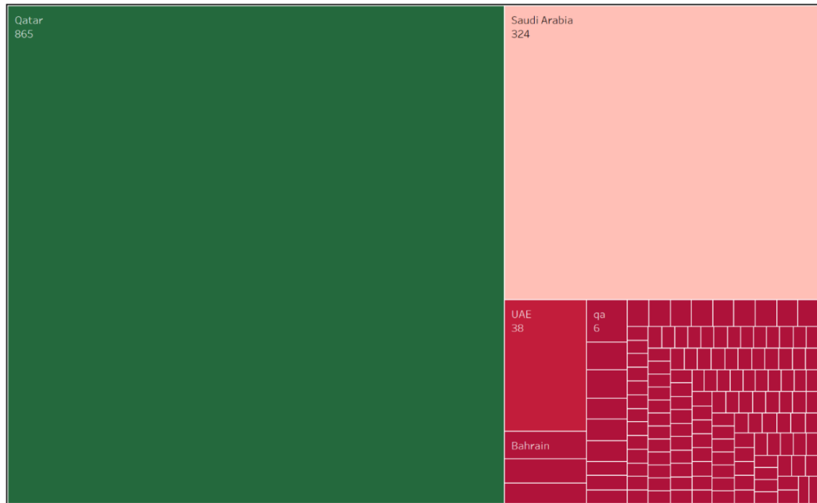
Figure 7. Location of accounts tweeting on the hashtag "Our hearts are with Tamim but not the two Hamads."

Most are from Qatar, closely followed by Saudi Arabia. The fact that many of the bots are tweeting from Qatar will likely impact Twitter's trending algorithm to show that this hashtag is trending in Qatar. The fact that the hashtag was trending in Qatar was used by critics of Qatar to demonstrate Qatari opposition to the "two Hamads." The tweet shown in Figure 8, from the account Mulaak Mohammed/@Ho213De (2018), states "praise be to God there is consciousness among some Qataris; they are starting to understand the scum that is the two Hamads."