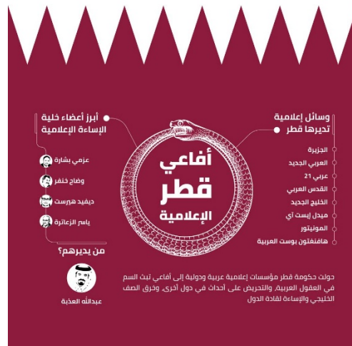
Figure 4. Infographic entitled "Qatar Media Snake."

All the infographics had a similar aesthetic quality, containing a limited color palette and lists of various derogatory entries about Qatar. Figure 4 is a typical example of this. It is titled "Qatar Media Snake" and lists numerous journalists and public figures based in Qatar, including Wadah Khanfar, Azmi Bishara, and David Hearst. It is interesting to note that while none of these figures has been singled out in the 13 demands made by the Quartet, all of them work for or have contributed to the outlets singled out in the demands.