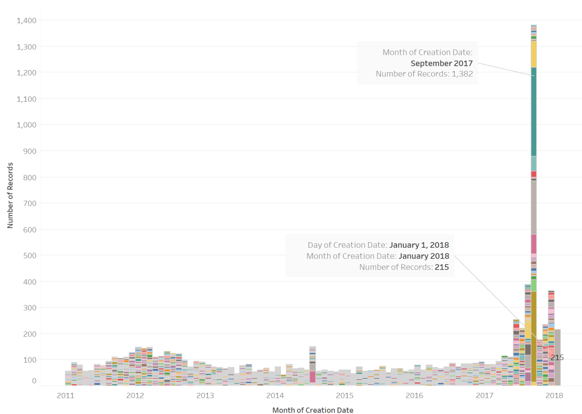
Figure 2. Twitter accounts mentioning Qatar by month and year of creation, sampled January 1, 2018.

This phenomenon continued to some degree until at least early 2018. A cursory examination reveals that bots were still involved in Twitter discussions using the word Qatar in January 2018. In a sample of approximately 9,786 tweets from unique accounts taken on January 1, 2018, about 18% (1,769) were bots. As shown in Figure 2, a large spike occurred in September 2017 in the creation date of bots.